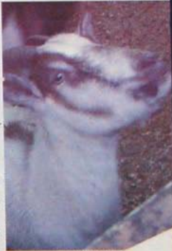
Carmelis Goat Cheese Artisan is home to 110 playful goats who provide milk that is later turned into goat cheese.

It's hard not to be enchanted with these creatures. Especially with the babies - the kids - which look like plush living dolls, but will soon grow up and contribute to the