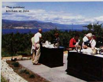
The outdoor kitchen at Joie.

Another new development: there is more to do than huck back cherries till your tongue turns purple and your stomach turns turtle. Especially in the last two to three years, restaurateurs and artisanal food suppliers and producers have emerged to complement the growth in wine touring. Wait another two to three years and the task will become even easier, but this summer it is already possible to enjoy an Okanagan holiday in which all the food groups are expertly taken care of. Some highlights: