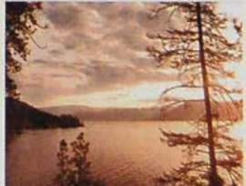
Wine Country Pleasures Clockwise from far left: An afternoon at the beach in Sunset City Park, in Kelowna; the terrace at Mission Hill winery's restaurant; Dungeness crab "cappuccino soup" at Fresco Restaurant, in downtown Kelowna; the sun sets over Okanagan Lake.