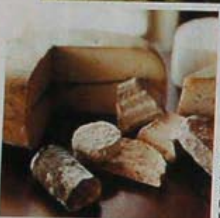
Canadian Classics Above: Chardonnay and Pinot grapes growing on the banks of Okanagan Lake, at Mission Hill Family Estate, in Westbank. Left: A selection from Carmel's Goat Cheese Artisan, a boutique dairy in Kelowna.